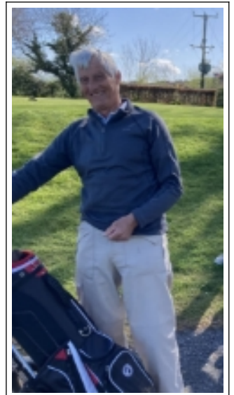
Golfers enjoy the good weather in April at Edenmore