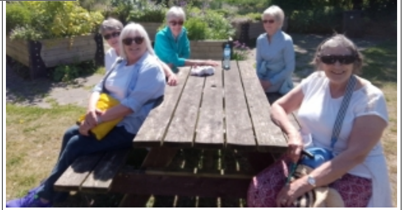
Let's Go visit the World of Owls near Randalstown