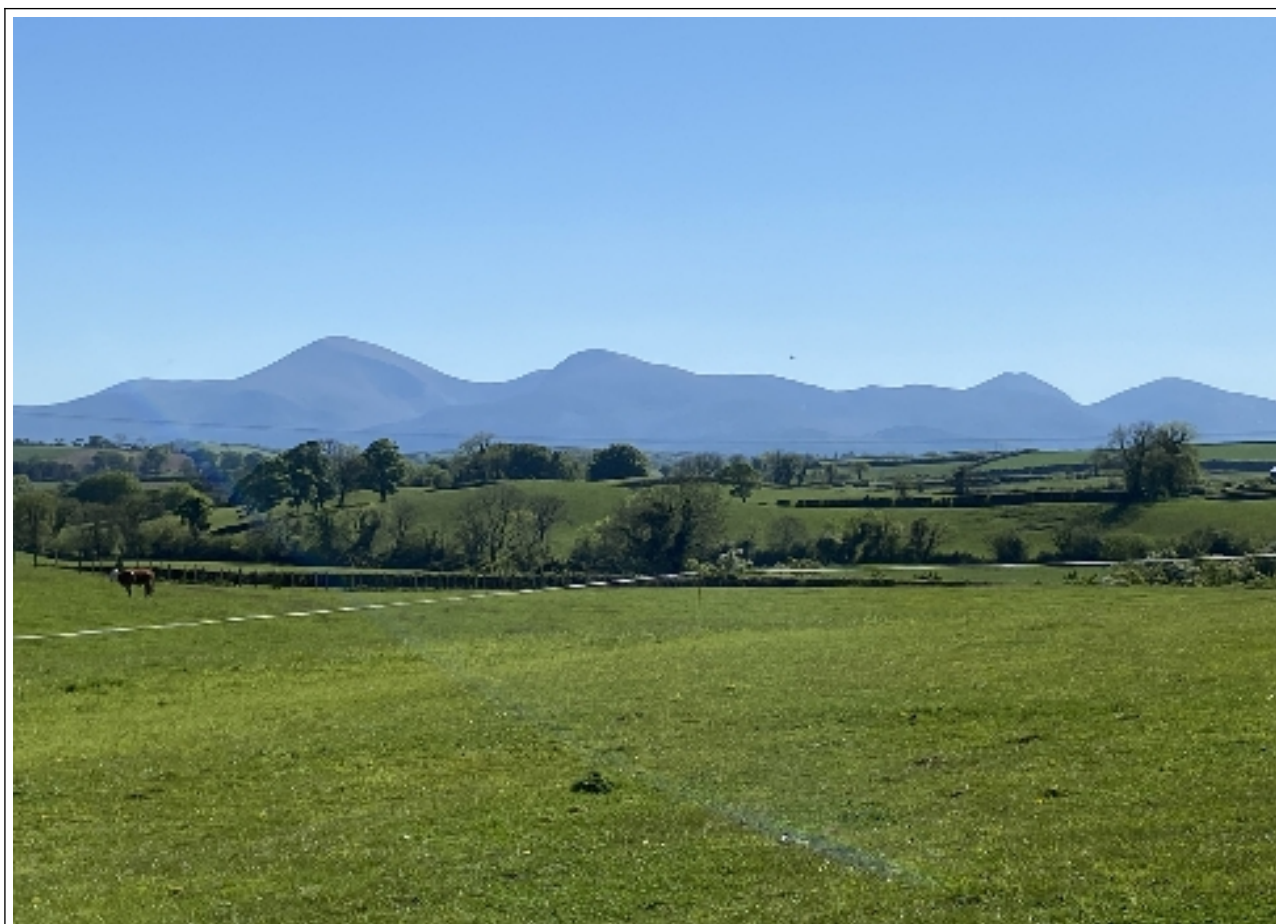
With a perfect view of the Mournes, the Garden group visit a garden near Seaforde