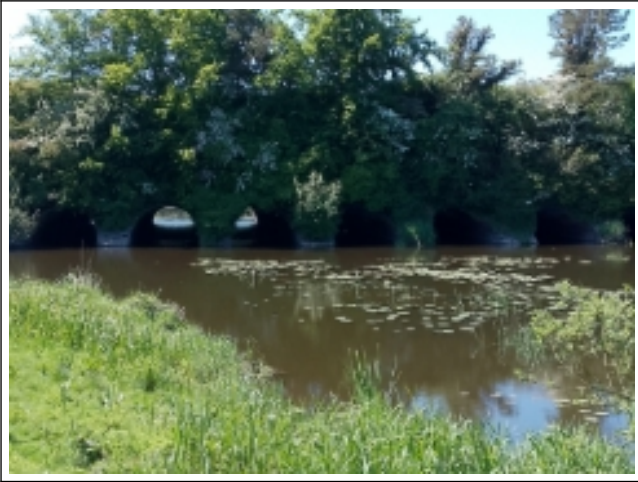
Saturday Ramblers walk along the Quoile River