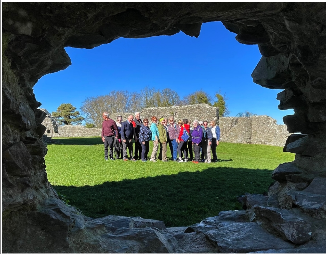
The Hole in the Wall Gang (Ramblers) at Dundrum Castle