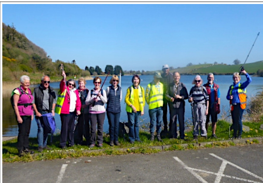
and on Saint Patrick's Way