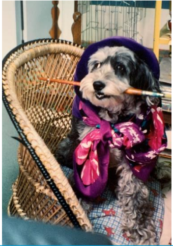
Tommy was pleased to see that finally, an artist with some flair had joined the painting group!