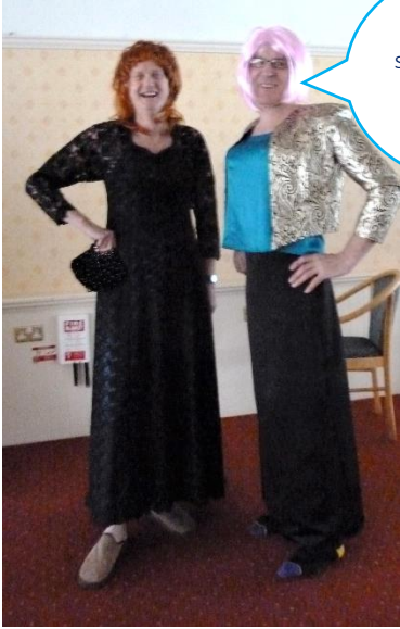
I thought you said we wouldn't see anyone we knew?!