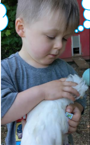
I think I'll name our new chicken KFC!