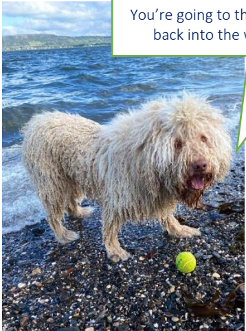
YOU CANNOT BE SERIOUS! You're going to throw the ball back into the water???