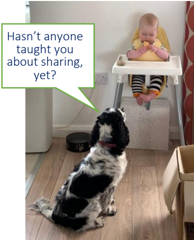
Hasn't anyone taught you about sharing, yet?