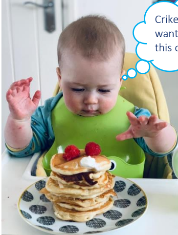
Crikey! Do they want me to eat this or climb it?