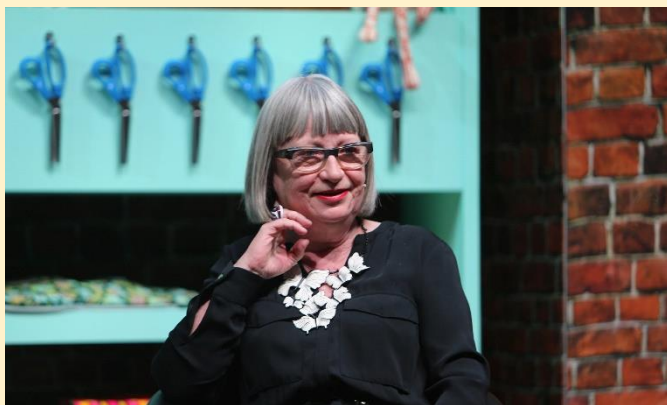
Esme Young is an English fashion designer and television presenter. Since 2016, she has been a judge on the BBC reality series The Great British Sewing Bee. (Wikipedia)