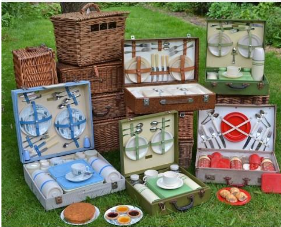
Pass me the strawberry cake, please!

Antique picnic sets can be found at auction from around £100 upwards, and the best can fetch several thousand pounds! But there are also plenty of vintage-inspired modern picnic sets available, which are perfect for spring picnics now that lockdown restrictions have eased.