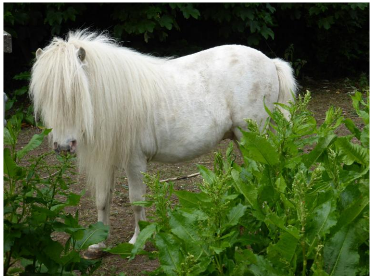
Still waiting for that haircut