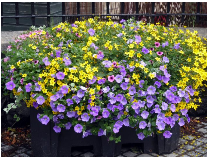
Wallace Park gets it right again