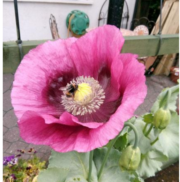
Bee at breakfast