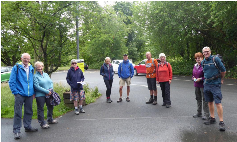
and Belvoir Forest