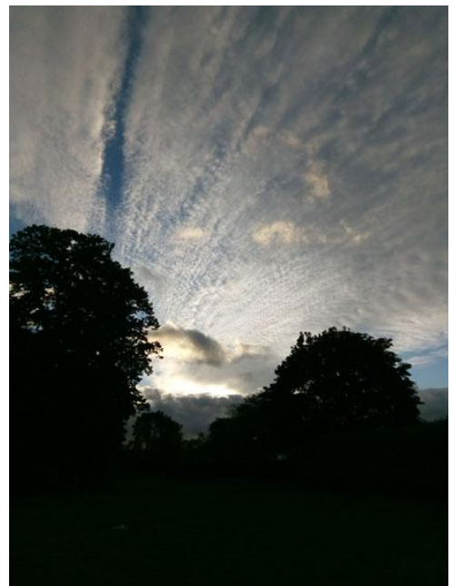
Another amazing sky